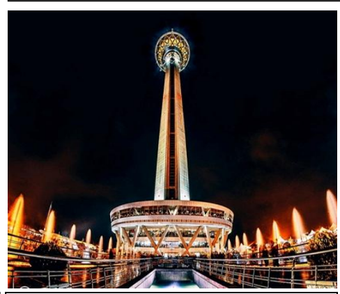
Milad tower(Tehran Province-Tehran)