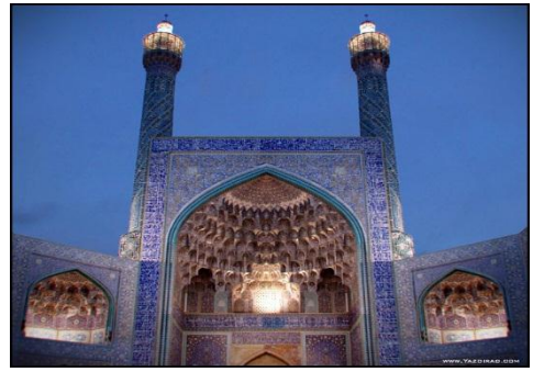
Shah Mosque(Isfahan Province-Isfahan)