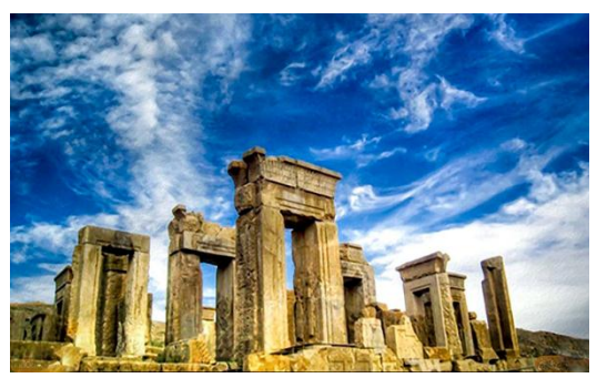
Persepolis (Fars province-Shiraz-Marvdasht)