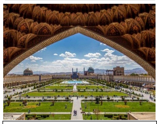
Naghsh-e Jahan Square(Isfahan Province-Isfahan)