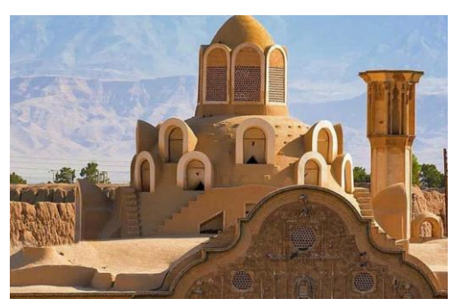
Boroujerdi Traditional House(Isfahan Province-Kashan)